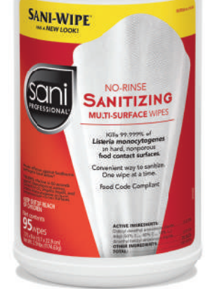
EPA No.: 9480-13

Sani Professional® No-Rinse Sanitizing Wipes are pre-moistened, ready-to-use wipes saturated with 380 ppm quaternary ammonium chloride. This product is EPA-registered, Food Code Compliant and effectively removes 99.999% of the most common foodborne pathogens within 60 seconds. It is used to sanitize hard, nonporous food contact surfaces and non-food contact surfaces without requiring a rinse. The product is disposable, which helps reduce the risk of cross-contamination.